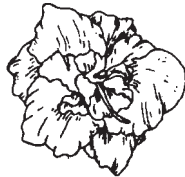
A double flowered daylily is formed when the sexual parts are manifest as an extra set of petals.