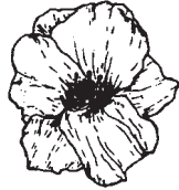
When both petals and sepals show no tendency to curl, the flower is call " flat ."