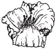
Recurved flowers have the ends of the segments tucked under.