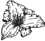
A triangular flower is formed when petals extend fully but the sepals curve under.